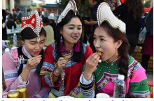
Locals enjoy themselves during traditional festival in Yunnan