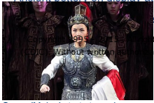
Opera 'Mulan' starts tour along historical Silk Road

Photo 1,000 masks from around the world gather in Shanghai Ancient pottery on display at Hemudu Site Museum