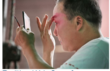
Traditional Yuju Opera faces dilemma

187 large gold coins found in 2,000-year-old tomb in Jiangxi