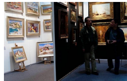
2015 Shanghai Art Fair opens