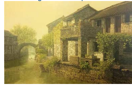
Fair reaches out to casual art fans