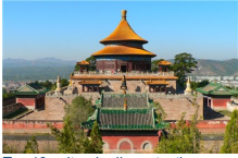
Top 10 cultural relic protection projects of 2014