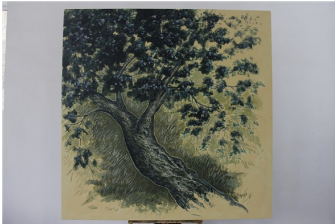
The Tree by Domenico Monteforte.

Artists from Tuscany in Italy have used brushes, colors and even a shuttlecock to portray their impressions of China.